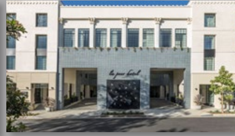
KIMPTON la peer hotel WEST HOLLYWOOD