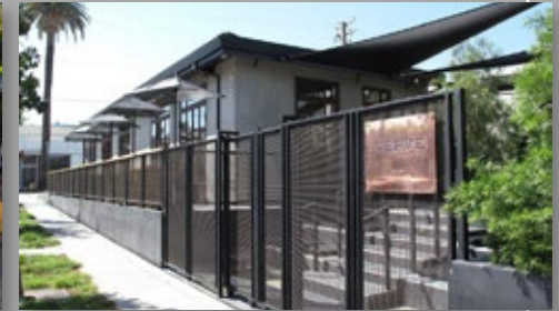
VERVE COFFEE ROASTERS