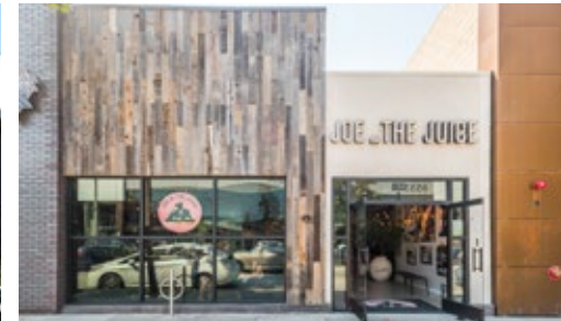
JOE & THE JUICE