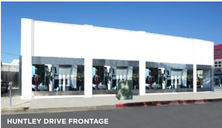
HUNTLEY DRIVE FRONTAGE