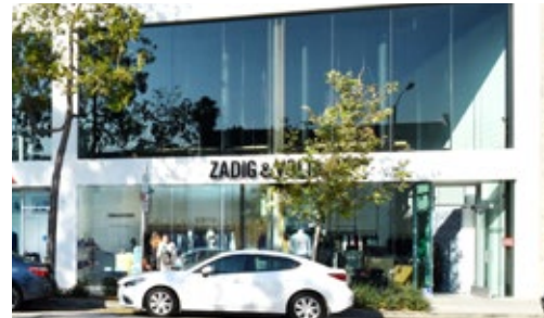
ZADIG & VOLTAIRE