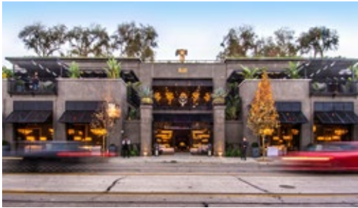
RH RESTORATION HARDWARE