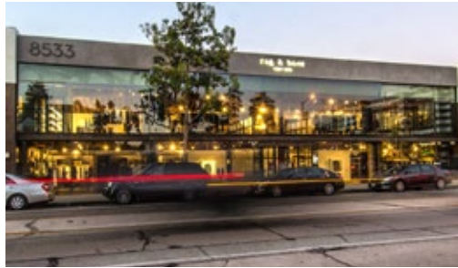
rag & bone