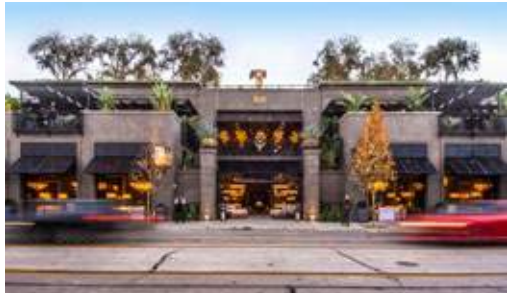
RH RESTORATION HARDWARE