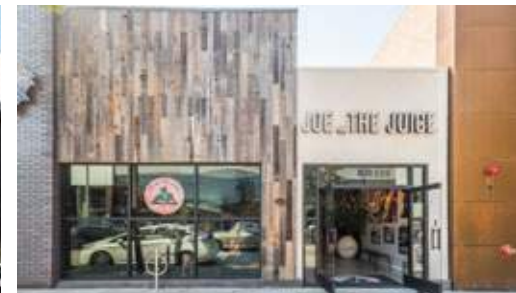
JOE & THE JUICE