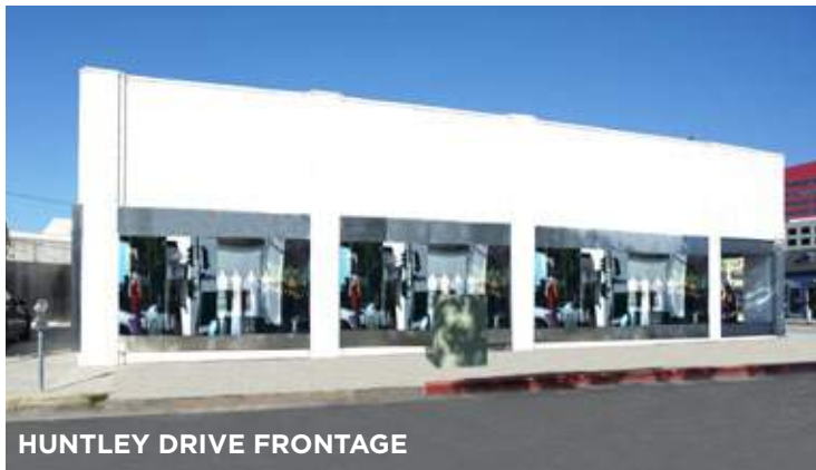
HUNTLEY DRIVE FRONTAGE