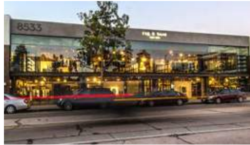
rag & bone