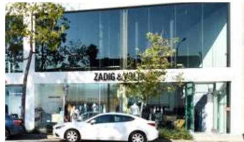
ZADIG & VOLTAIRE