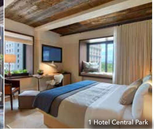
1 Hotel Central Park