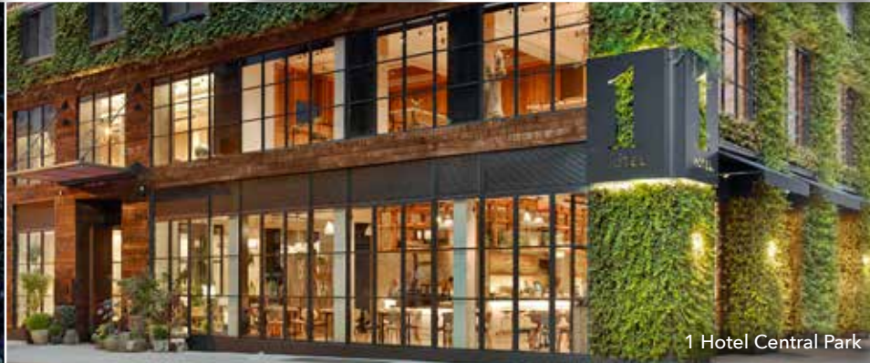
1 Hotel Central Park