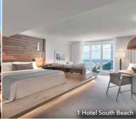
1 Hotel South Beach