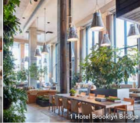
1 Hotel Brooklyn Bridge