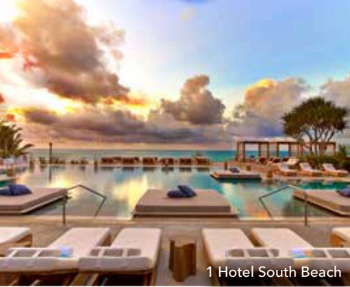
1 Hotel South Beach