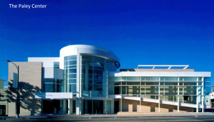
The Paley Center