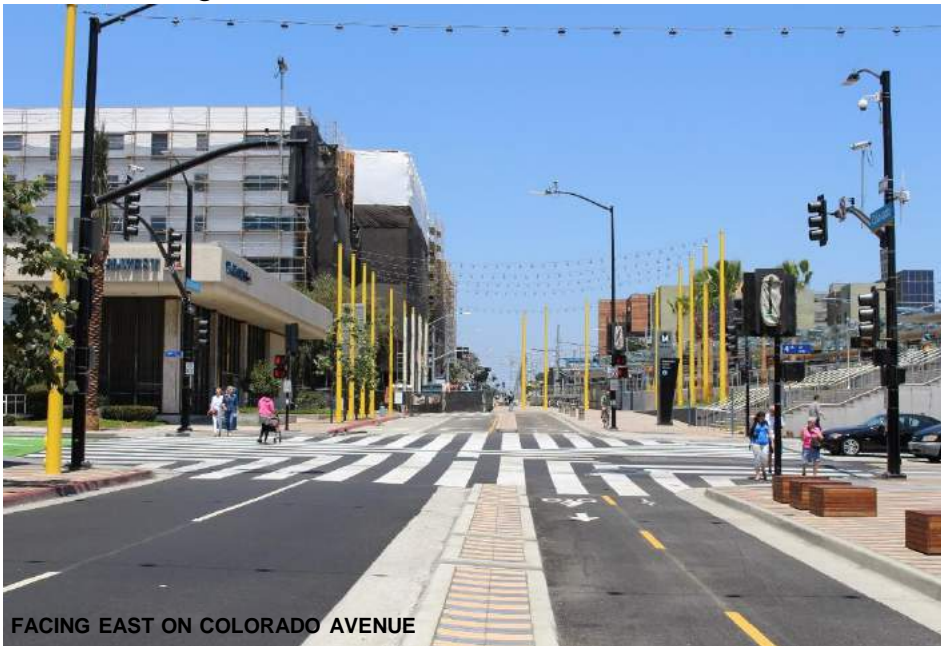
FACING EAST ON COLORADO AVENUE

Located on the corner of Colorado and 4 th Street, directly across from Santa Monica Place and the Metro station and walking distance to Third Street Promenade and the Santa Monica Pier.