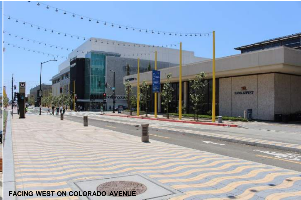
FACING WEST ON COLORADO AVENUE

The information contained herein has been obtained from sources deemed reliable but has not been verified and no guarantee, warranty or representation, either express or implied, is made with respect to such information. Terms of sale or lease and availability are subject to change or withdrawal without notice.